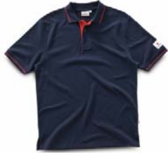
Poloshirt with Name and Starting number