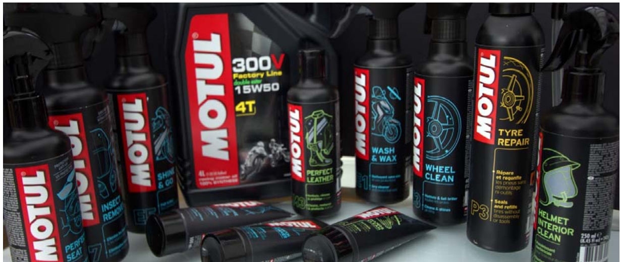
1x Motul service and merchandising package for a value of over € 100,-