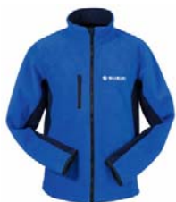
Fleecejacket with Name and starting number

the SUZUKI Challenge Package contains following items: (conditional content)